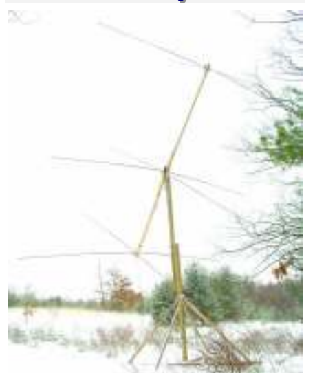
Antenna by Bob Sletten Hi Radio Astronomers,

Big picture wise, the radio astronomy stuff still is finding it footing while leveraging opportunities as they present themselves. One such opportunity involves a relatively easy project next month in conjunction with the Leonid's Meteor shower. In a nutshell, the idea is to try and hear low frequency radiation from meteors, as there is some evidence that meteors make very low frequency (VLF) electromagnetic radiation (See references below). The current issue of S&T magazine proposed an opportunity given the timing of the Leonids to test that theory. The date of the shower is November 18 –19. The predicted peak is 11:45 PM that Saturday night.