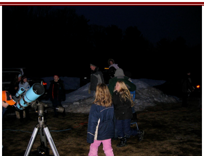
Gathering to see Saturn