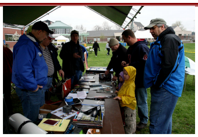
Under the NHAS tent.