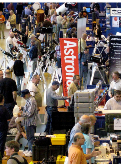
Lots of telescopes and publications at this year's show.