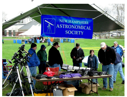
The NHAS Tent, albeit a little soggy.