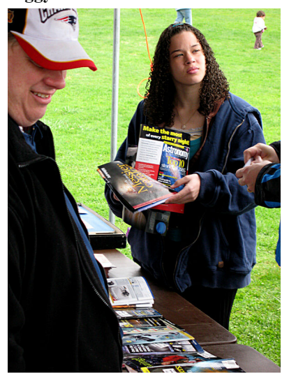
A young lady who stopped by during he day to pick up information and ask questions.