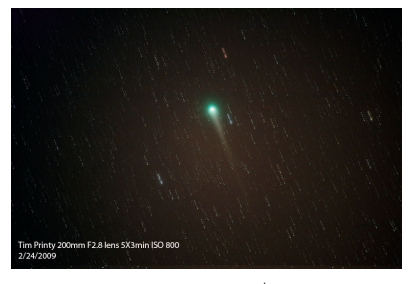
★ Tim Printy

reappear in a few days (I think). I really have not finished processing the image but I wanted to share it with everyone.