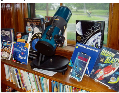
A rare view of the Langdon Library scope in its display (the scope is usually checked out).