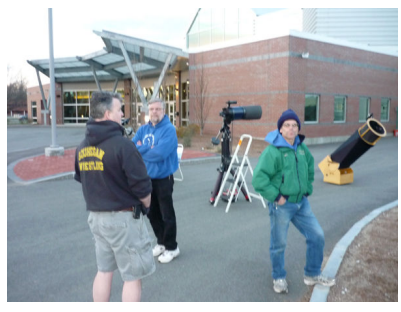
Ready for Friday evening's observing session at Aerospacefest