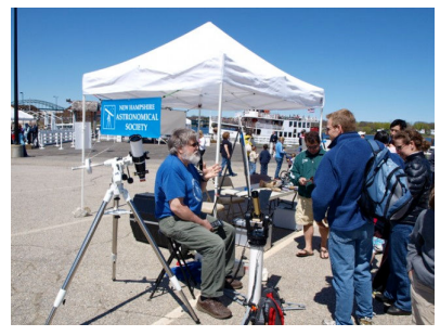
Marc offers both white light and H-\alpha