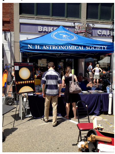
NHAS's new booth in action

who took the time to hunt down the planet stickers pasted down on Congress St.