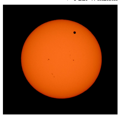
Transit of Venus from Exeter NH